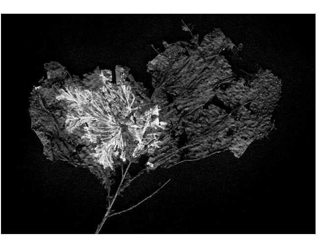
Debra Solomon, Entropical / En Necromasse, mycelium, 2015