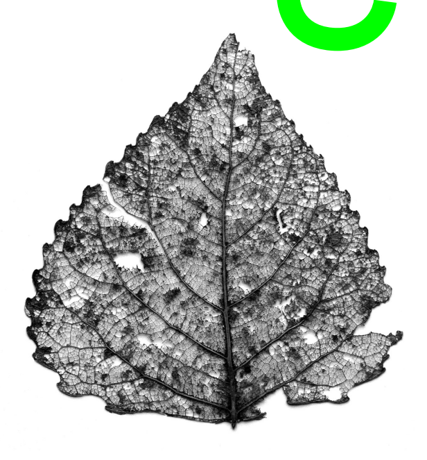
Debra Solomon, Entropical / En Necromasse, leaf skeleton, 2015

www.entropical.org www.urbaniahoeve.nl www.dyne.org