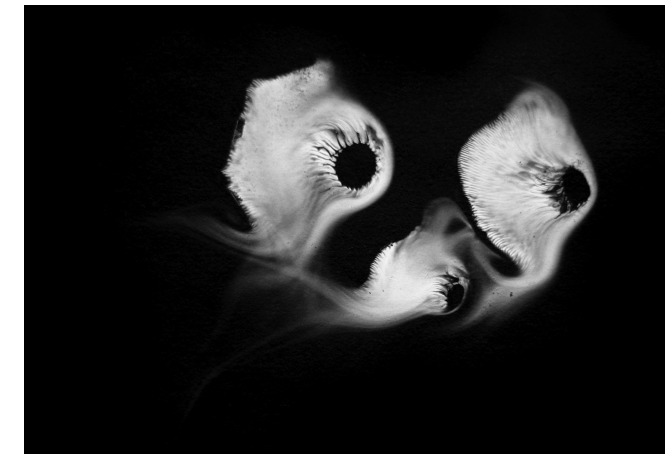
Debra Solomon, Entropical / En Necromasse, spore print, 2015